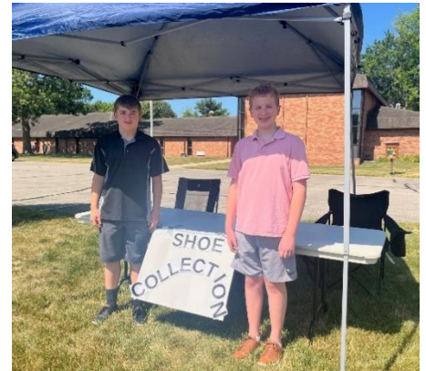
Sorting the shoes!